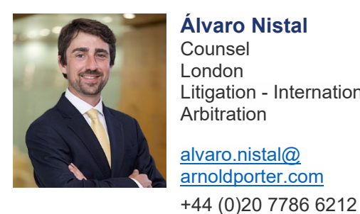
London Litigation - International Arbitration alvaro.nistal@ arnoldporter.com